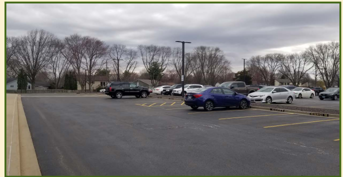
Last spring, the onset of COVID-19 was a complete mystery to everyone in Illinois. Facing the unknown with caution, Gov. JB Pritzker ordered all state agencies, including TRS, to implement “remote work” procedures. The result was the image on the left – an almost vacant parking lot in the middle of the week at the Springfield office. Fast forward one year later: the state’s response to the pandemic and the distribution of effective vaccines have allowed state agency operations to inch back to the “old normal,” as the image demonstrates from March 2021.

Last March, the System closed its offices to visitors in order to comply with social distancing recommendations. In a few hectic days, TRS implemented preplanned “remote work” procedures and successfully converted all member assistance efforts to online and telephone platforms.