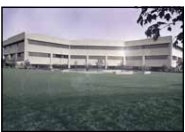
TRS Springfield office - May 1980

Four benefit improvements were made for members enrolled in TRIP: the annual plan deductible, out-of-pocket maximum, inpatient co-payment, and Medicare deductibles and co-payments.