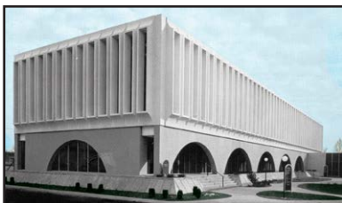
Iles Park Place the TRS office from 1966 - 1979