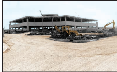
TRS Springfield office - Nov. 1978