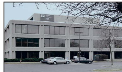
TRS Lisle office Building 1987 - present (Northern Area Office in Lombard 1974-1987)