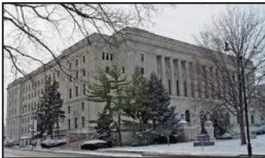
Centennial Building (now the Howlett Building) the TRS office from 1939 - 1955

From July 1, 1939 to the present, extensive amendments have been enacted to maintain various benefit and funding provisions within TRS. The amendments to TRS are listed within the following pages.