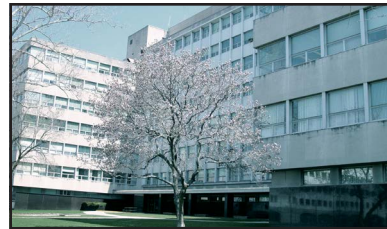
Stratton Building the TRS office from 1955 - 1966