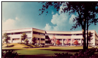
TRS Springfield office Architect rendition