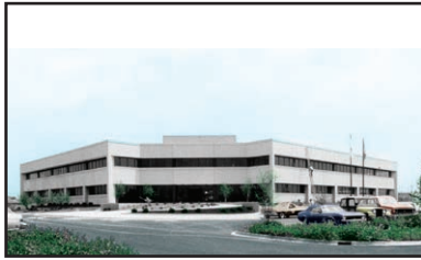
TRS Springfield office - July 1979