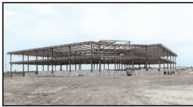
TRS Springfield office - July 1978