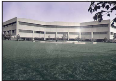
TRS Springfield office - May 1980