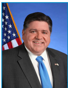
Gov. JB Pritzker

For the third year in a row, Gov. JB Pritzker has proposed contributing more to TRS than required by the state's pension funding law – a practice that has helped improve the TRS long-term funded status.