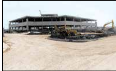
TRS Springfield office - Nov. 1978