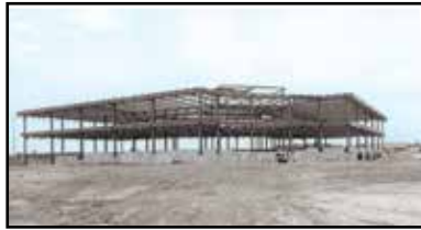
TRS Springfield office - July 1978