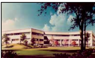
TRS Springfield office Architect rendition