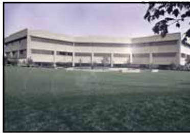
TRS Springfield office - May 1980