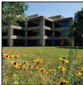
TRS Lisle office - present

In order for a TRS member to take advantage of the Early Retirement Option, all of the member’s employers during his or her last year of employment must approve the member’s use of ERO and certify eligibility for the program. If all final-year employers do not approve and certify the