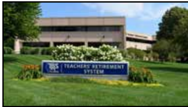
TRS Springfield office - present