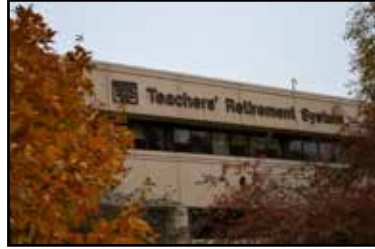
TRS Springfield office - present

annuitant forfeiting their benefit for exceeding post-retirement work limitations.