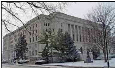
Centennial Building (now the Howlett Building) the TRS office from 1939 - 1955

From July 1, 1939 to the present, extensive amendments have been enacted to maintain various benefit and funding provisions within TRS. The amendments to TRS are listed within the following pages.