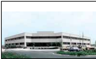
TRS Springfield office - July 1979