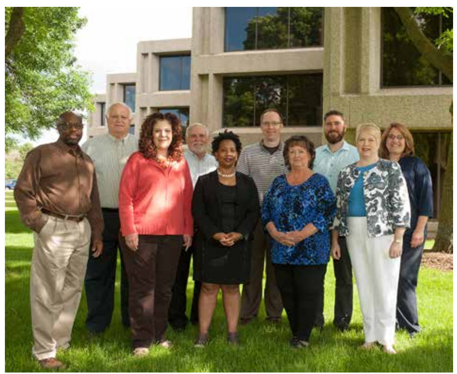
TRS staff located in Lisle, June 2016