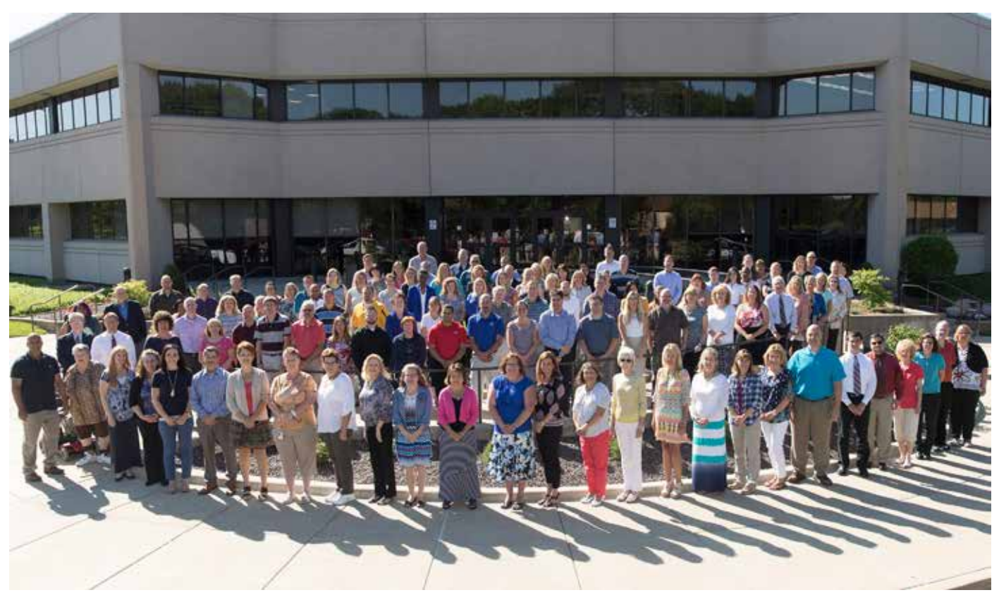
TRS staff located in Springfield, June 2016